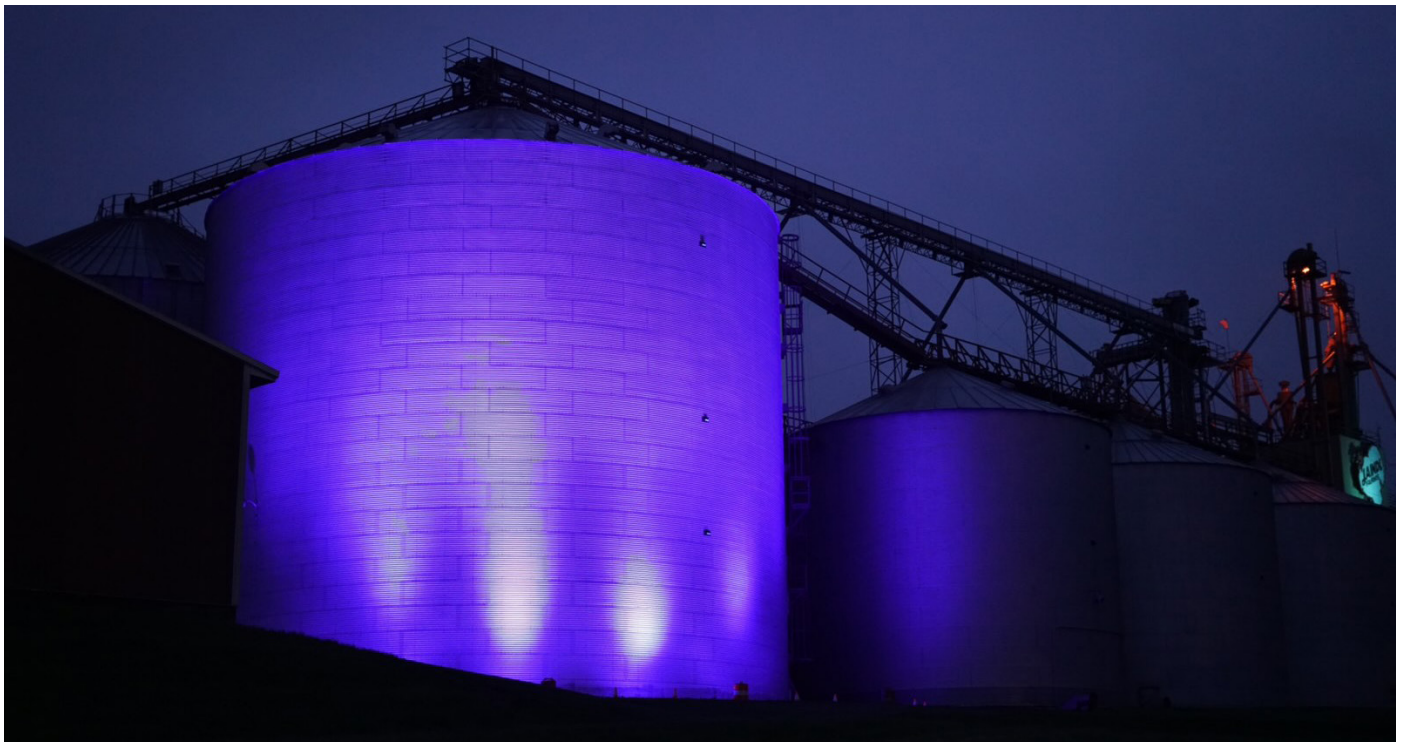
Silos at the Jaindl Farms lit up blue in support of first responders.